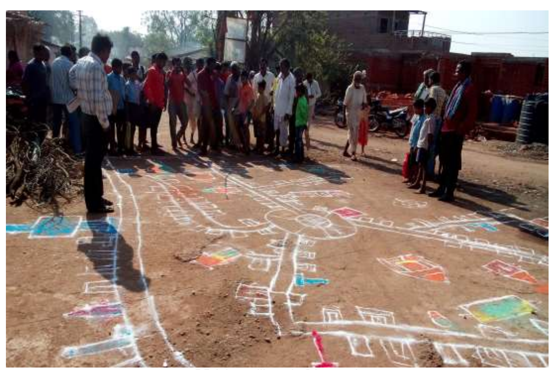
PRA in a village in Dharwad

The project is promising progressive gains in participation, adoption, self reliance, exchange of knowledge and institutionalization. Regular orientation meetings with fixed planning processes are enabling high motivation levels, clarity of purpose and reorientation of strategies where necessary within the project proposal guidelines.