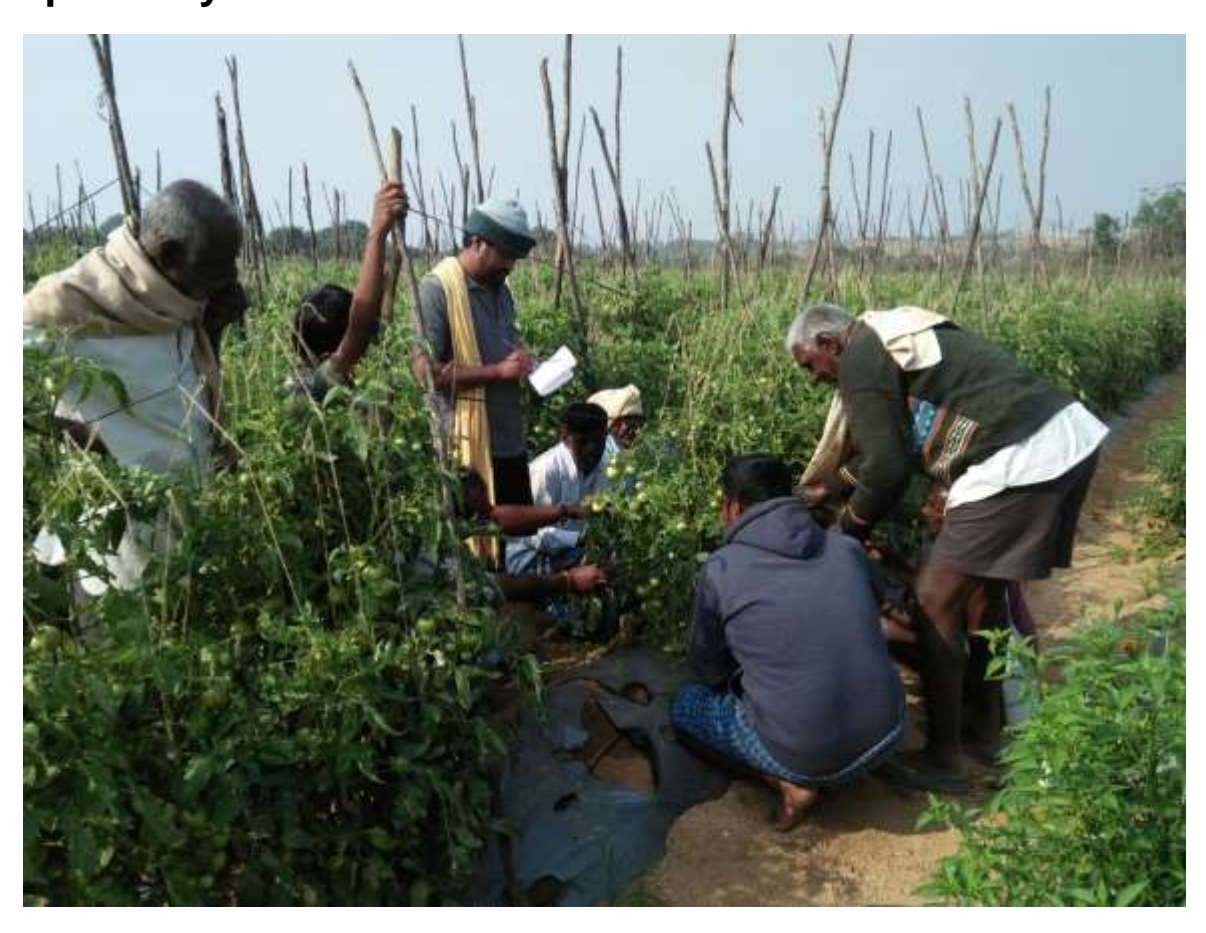
This programme is supported by KSTePS to promote ecological agriculture in 10 villages of Kolar district of Karnataka State during 2017-18.

Under the proposed KSTePS supported programme, ten villages were identified in Chintamani Taluk – namely, Ragimakalahalli, Musturpatna, Devapalli, Venkatarayanakota, Guttapalya, Guntturgadda, Yerraiahgarahalli, Kondavenakapalli, K. Raguttahalli, Narasapura. A local field office was set up for easy implementation of the programme.