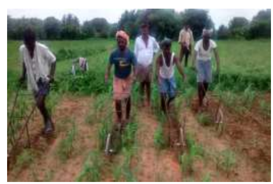
Use of cycle weeders

prepared and used botanicals like Dashaparni, Panchagavya, Jeevamrut, Ganajeevamruta, egg solution, NeemKashaya. Around 300 pheromone traps were mobilized and installed in 75 farmers' fields. Vermicomposting was taken up by 4 farmers while Compost units using compost culture was established in 20 farmers' fields for improving soil fertility and reducing use of chemical fertilizers. In collective activities, in farm resource centres in Yedira, Kaslabad and Mustipally villages, farmers have taken up production of botanicals.